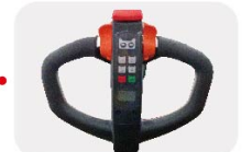
Smart Handle (Optional)