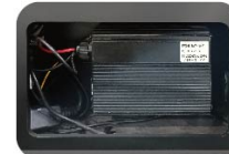
Built-in Charger (Optional)