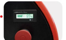
Battery Protection Stopper