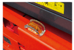
Emergency falling and dual flashing warning lights