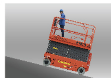
Strong climbing ability