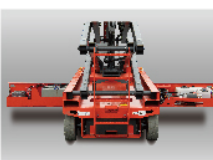
Rotary maintenance pallet