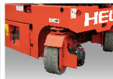
Small turning radius