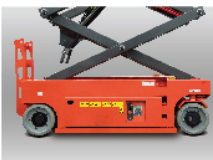
Auto-protection on holes on the ground